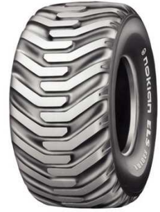
ELS Radial / ELS SB