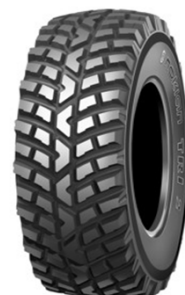
TRI 2 / TRI 2 Steel