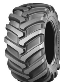
Forest King TRS L-2