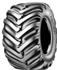
Excavator TRS LS-2