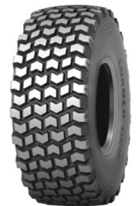
Loader Grip L-3