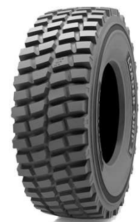
Loader Grip 2