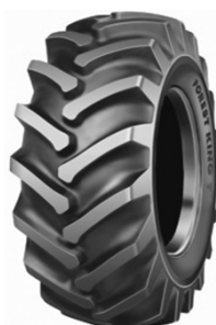
Forest King T