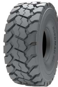
Nordman Mine E-4