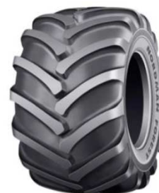
Nordman Forest TT