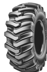
Forest King TRS