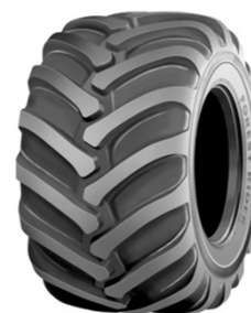
Forest Rider SF / SB