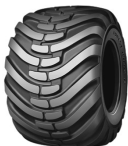
Forest King F