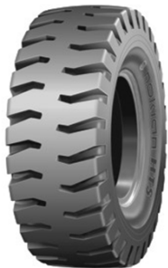
HTS E-3 / E-4 Kaevandusrehvid