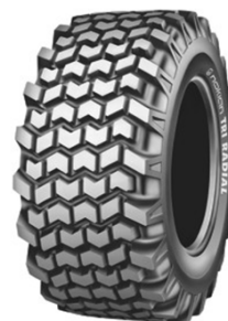
TRI / TRI Steel