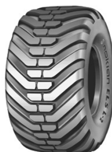
Forest King ELS L-2